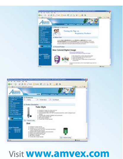
for the Flowmeter part configurator and much more!

CE options are available for the Amvex Thorpe Flowmeters. They are available in USA and ISO colors and Amvex Flowmeters are designed to meet all current HCA, ISO and FDA requirements.