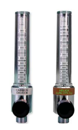
Dual Flowmeter Assembly